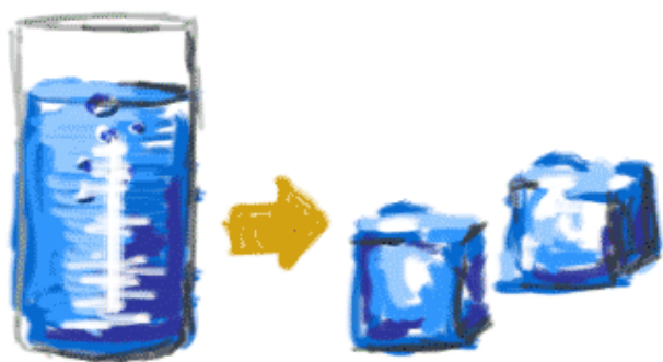
PHYSICAL CHANGE OF WATER INTO ICE